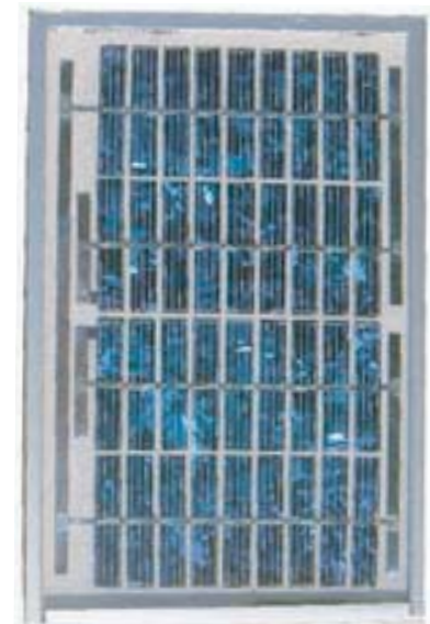
Power Up 2 Watt Module